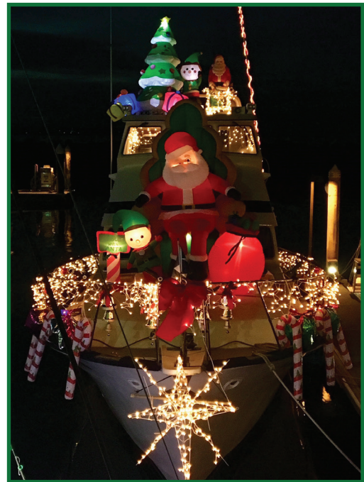
Don't miss Holiday on the Docks in the guest moorage now through January 3rd.

The Edmonds Yacht Club's annual "Holiday on the Docks" is in full swing. Come on down to the marina any night of the week now through January 3rd and enjoy this festive display of lights. The boats can be seen from the Port of Edmonds public plaza located directly behind Anthony's restaurant.